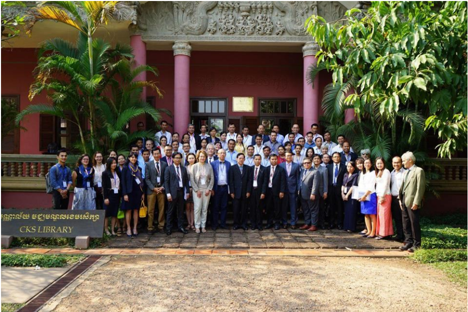
The GReSH-CAM team and the participants of the first workshop on Developing Research Capacity in Social Sciences and Humanities (Siem Reap, Cambodia — March 2018)