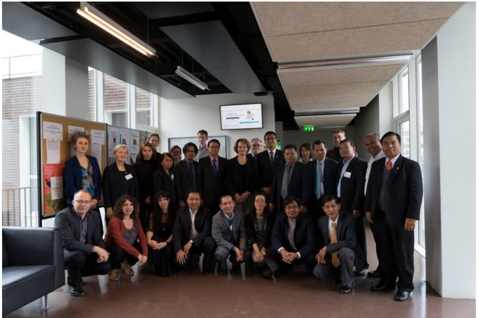
The GReSH-CAM team during the kick-off meeting at Inalco